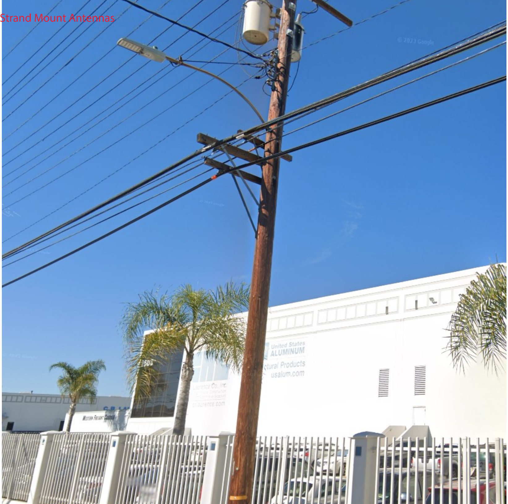
Item 1798: Strand Mount Antennas